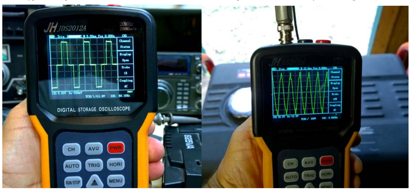
Output waveform from my Homelite generator

I was surprised at the generator sine wave. I expected much worse. The UPS sine wave did not come as a surprise.